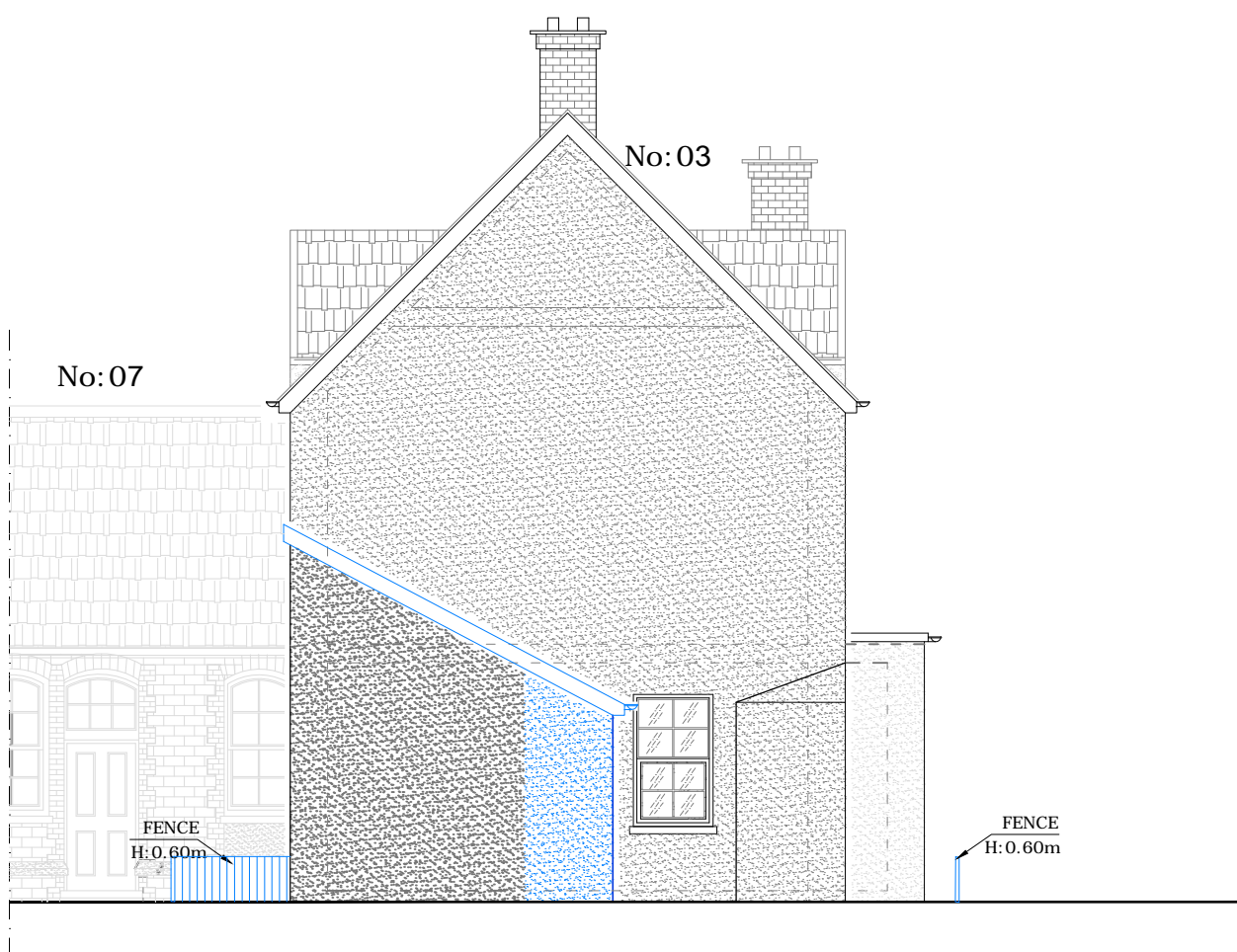
PROPOSED SIDE ELEVATION SCALE: 1/100