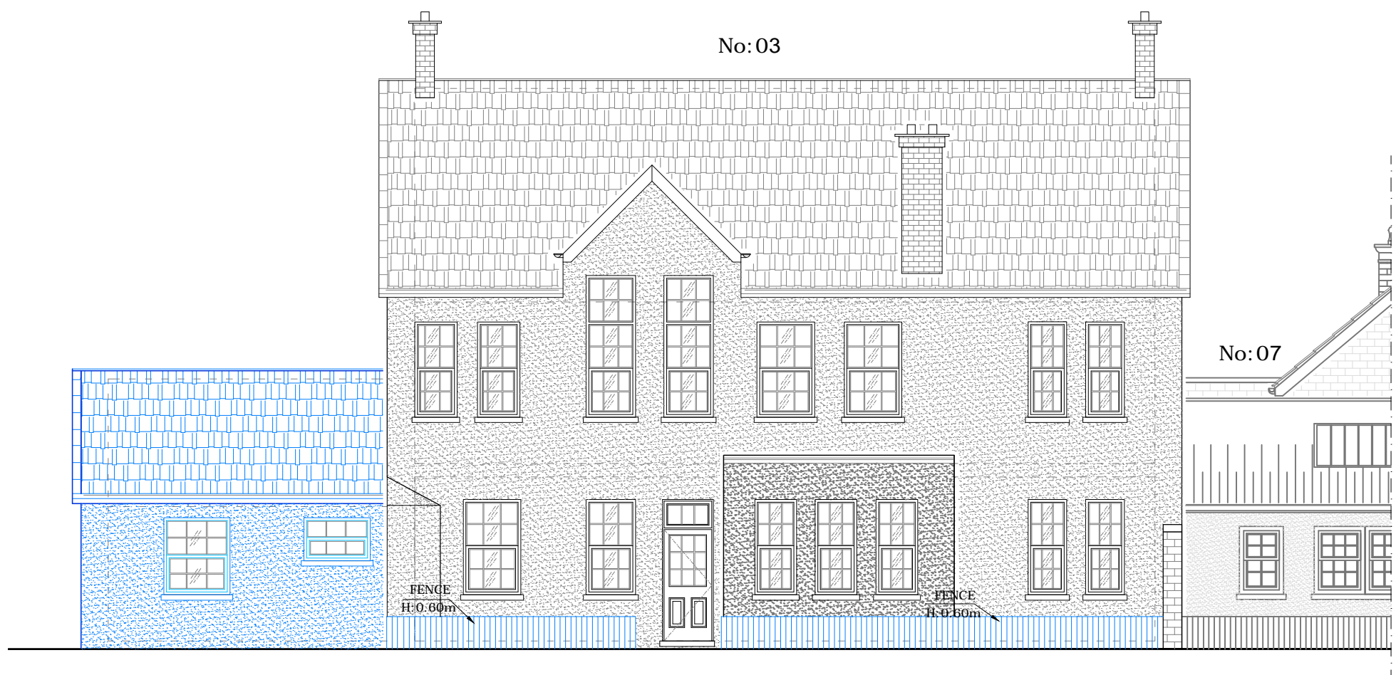
PROPOSED FRONT ELEVATION SCALE: 1/100